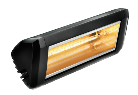
ATC Sienna 2200W Infrared Heater Black