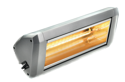
ATC Sienna 2200W Infrared Heater Silver